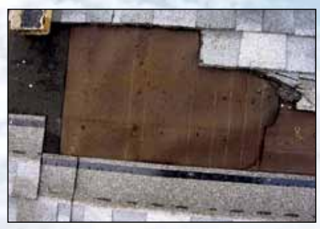
Blown-off shingles can expose your home to structural damage, mold, and mildew.