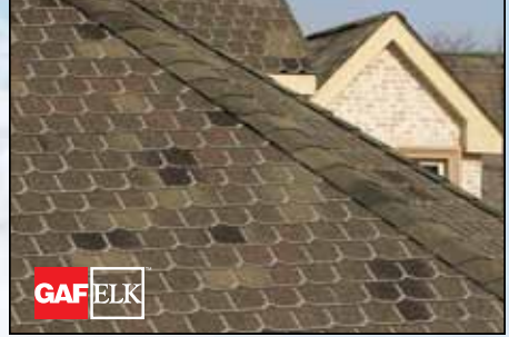
GAF-Elk shingles with Class F and Class H wind ratings are the safest choice for protecting your home.